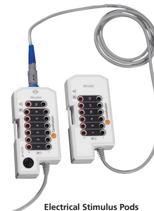
Electrical Stimulus Pods

The probe heads are available as two (2) large probes (0.8" (2 cm) between prongs) and two (2) small probes (0.4" (1.1 cm) between prongs) both in a straight and an angled (45°) version. The probe heads are rounded to optimize contact while minimizing discomfort. There is also a probe head available with touch proof connectors to be used with external electrodes.