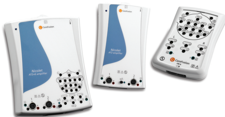
L to R: Nicolet 2+6 Channel Amplifier, 2 Channel Amplifier, HB-6 Head Box

The stimulus can be set to non-recurrent or recurrent stimulation. The stimulus rate can be varied between: 0.1 – 100 stimuli per second (Hz).