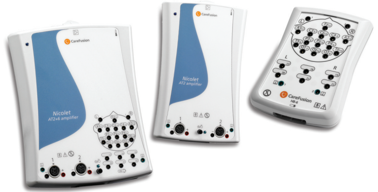
L to R: Nicolet 2+6 Channel Amplifier, 2 Channel Amplifier, Head Box